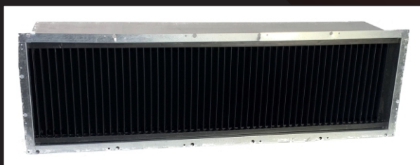
EZDark Ventbox Assembly

Our newest addition is the EZDark line of light traps. This design utilizes our patented ribbed panels and our newly designed EZDark panel strip. The EZDark strip eliminates rods, spacers, and end caps. Assembly time of the Light Trap is cut in half with the easy to use EZDark strip.