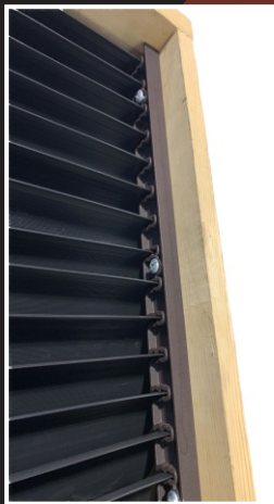
View Of EZDark Assembly

Darkout Systems, Or Light Traps , are primarily used for poultry and horticulture applications. Their purpose is to allow maximum air flow into the poultry or green house while reducing light entry as much as possible.